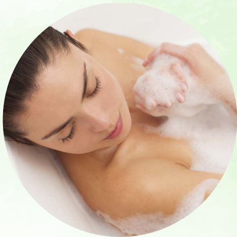
BATH & BODY CARE

Our promise is to create the most effective, scientifically proven botanical blends, formulated with pure and safe ingredients.